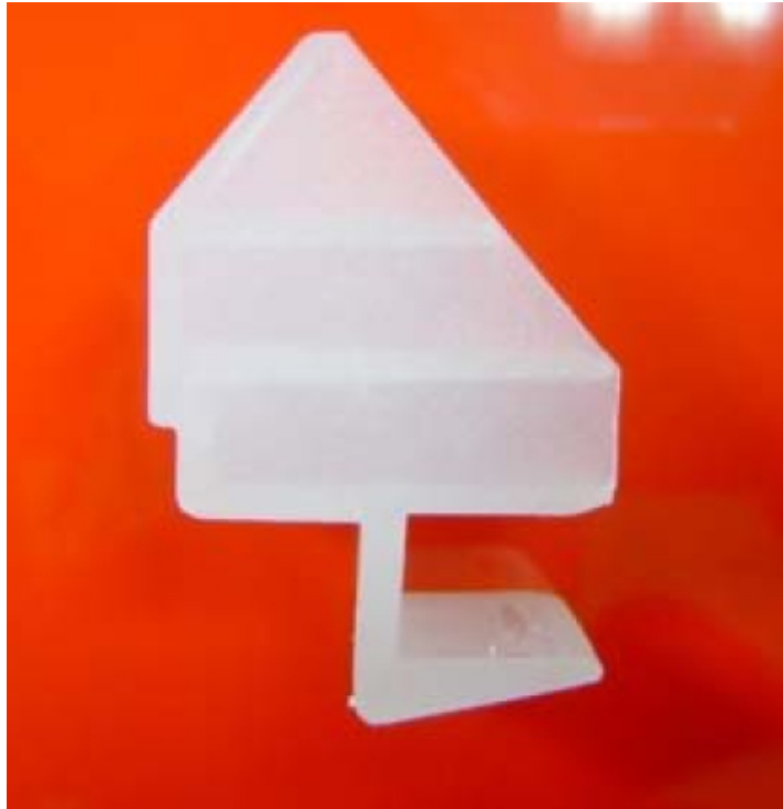
Shelf Safety Spacer

You can now remove the fitting and reposition the shelf.