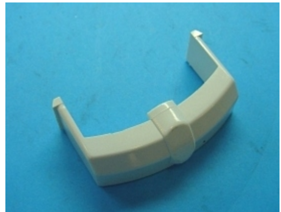
Light Switch Cover