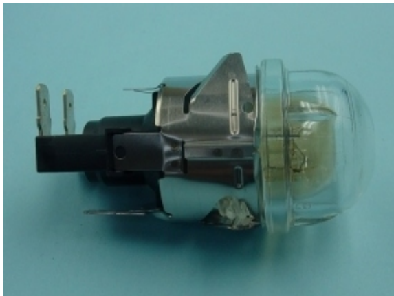
Oven Lamp Assembly